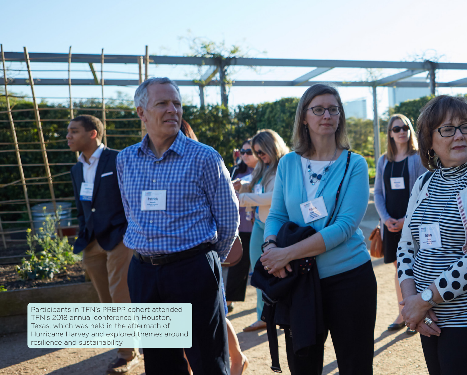
Participants in TFN's PREPP cohort attended TFN's 2018 annual conference in Houston, Texas, which was held in the aftermath of Hurricane Harvey and explored themes around resilience and sustainability.

CDP, that assessed the organization's internal capacity and the external community's capacity to engage in disaster response. CDP also provided the cohort with a technical curriculum centered on addressing disasters along with the importance of community development. In PPREP 1.0 and 2.0, following the workbook process, participating foundations applied for PPREP implementation grants to fund activities needed to fill the gaps and meet the needs highlighted in their assessment. PPREP hosts two annual gatherings, in-person and virtually, that allow the community foundations to share with each other about the successes and challenges they are experiencing in their own communities and the lessons they have learned. The program's emphasis on joint learning and strengthening community resilience encourages community foundations to build relationships between community members and emergency