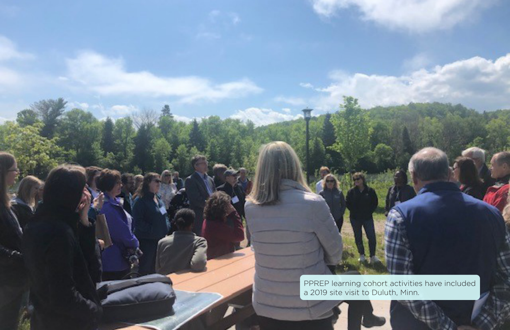
PPREP learning cohort activities have included a 2019 site visit to Duluth, Minn.