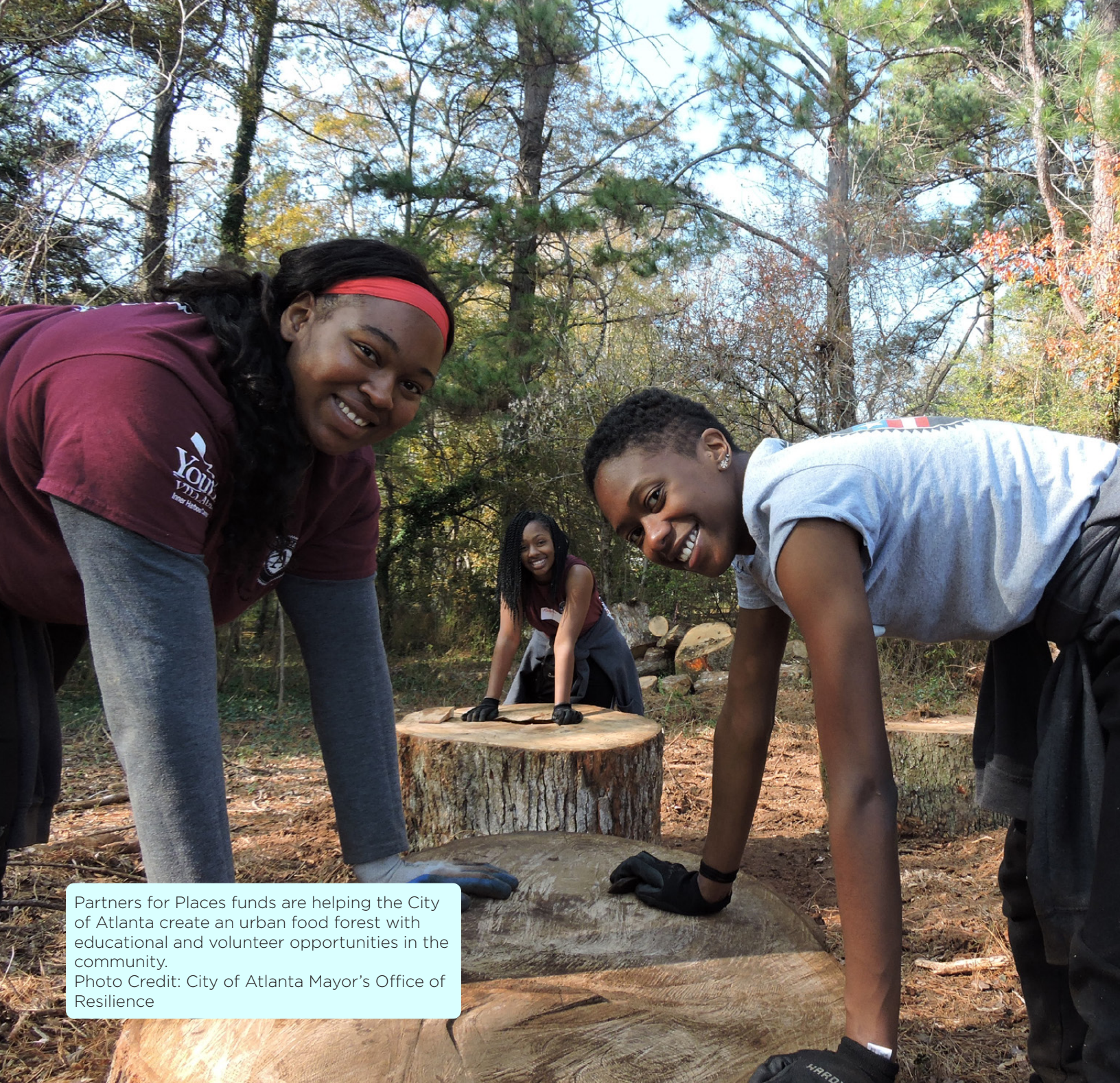
Partners for Places funds are helping the City of Atlanta create an urban food forest with educational and volunteer opportunities in the community.