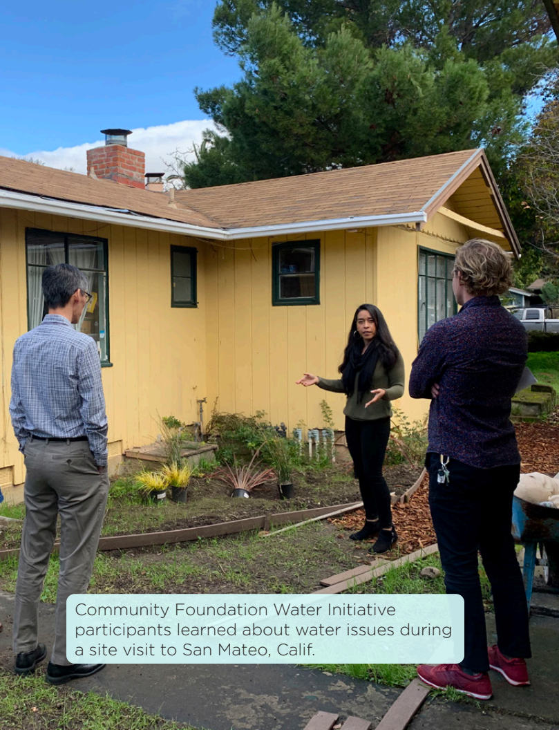
Community Foundation Water Initiative participants learned about water issues during a site visit to San Mateo, Calif.