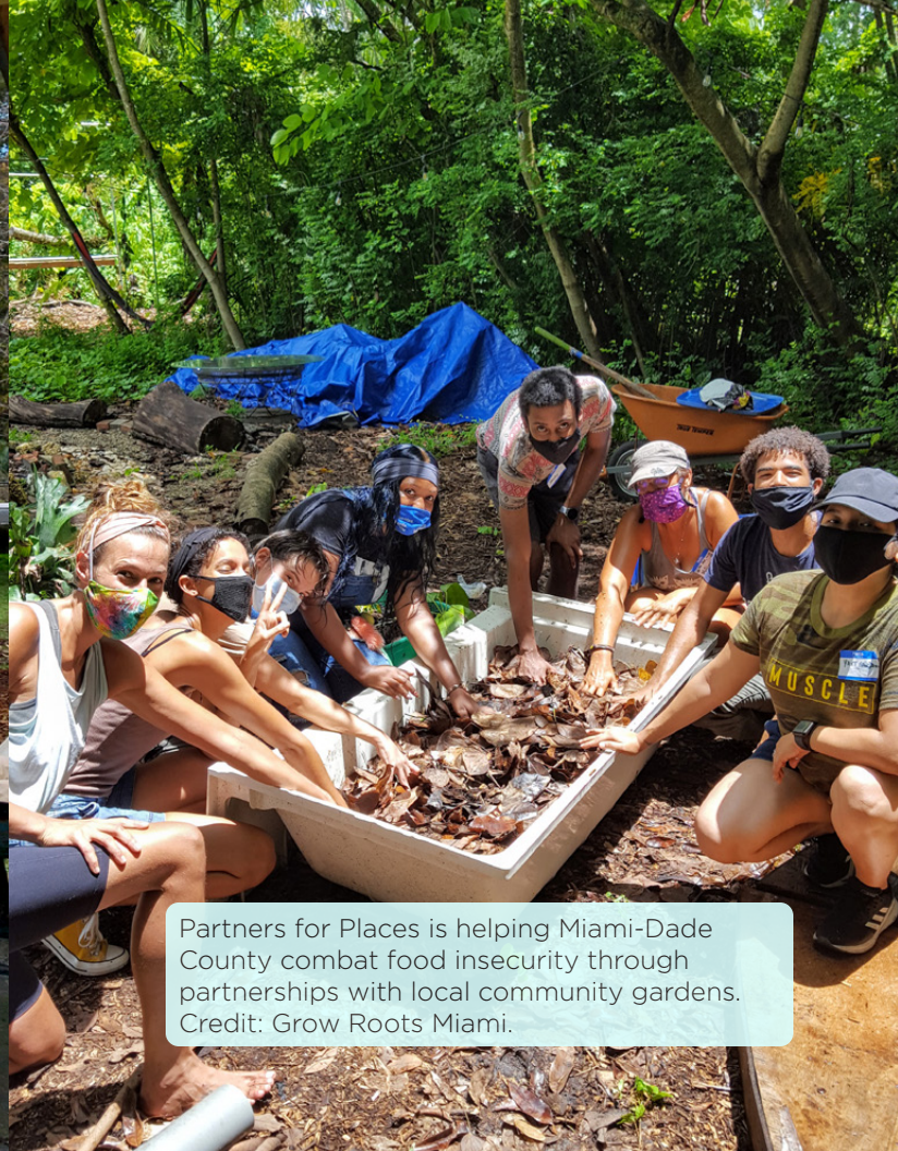
Partners for Places is helping Miami-Dade County combat food insecurity through partnerships with local community gardens.