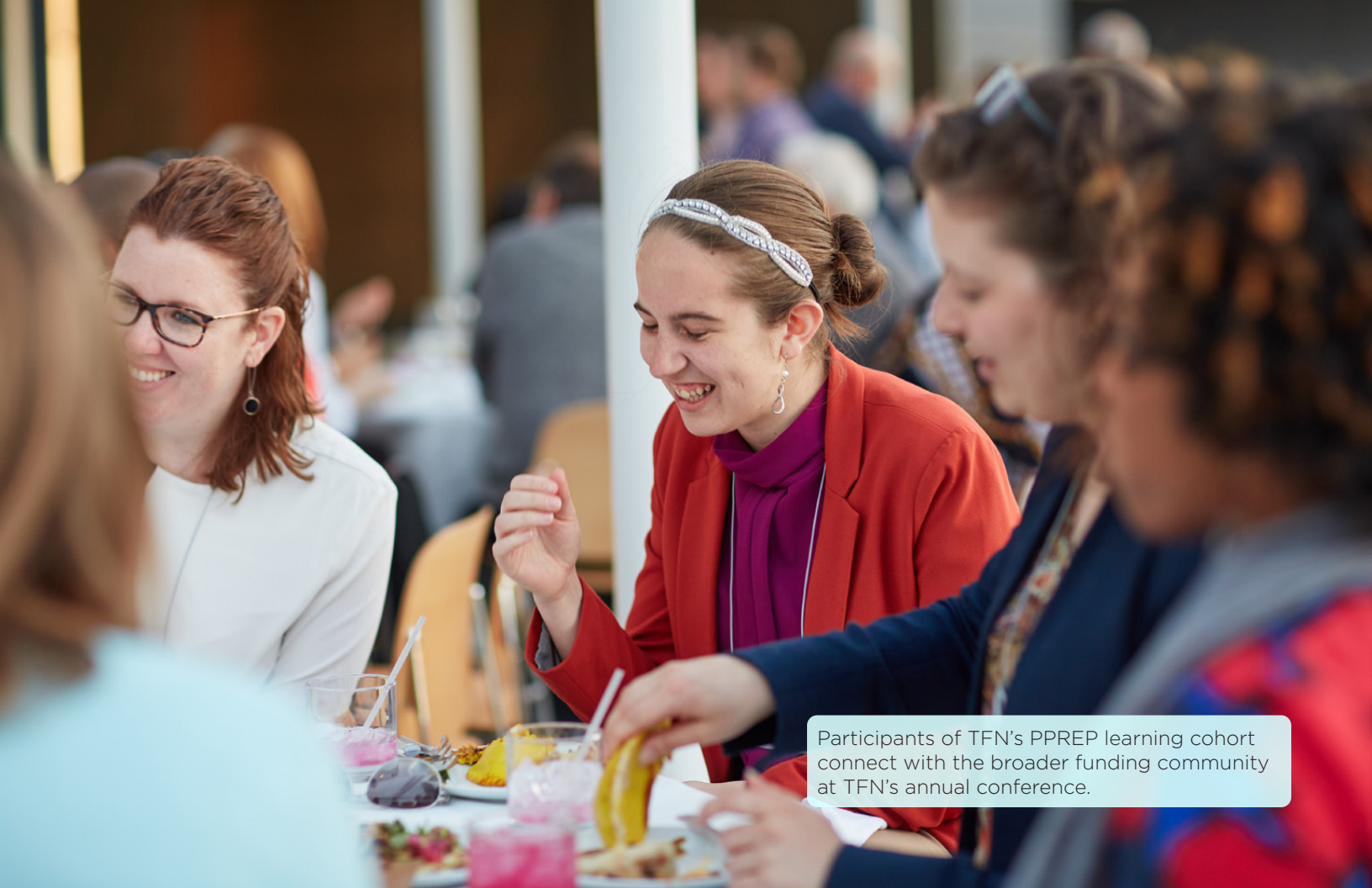
Participants of TFN's PPREP learning cohort connect with the broader funding community at TFN's annual conference.