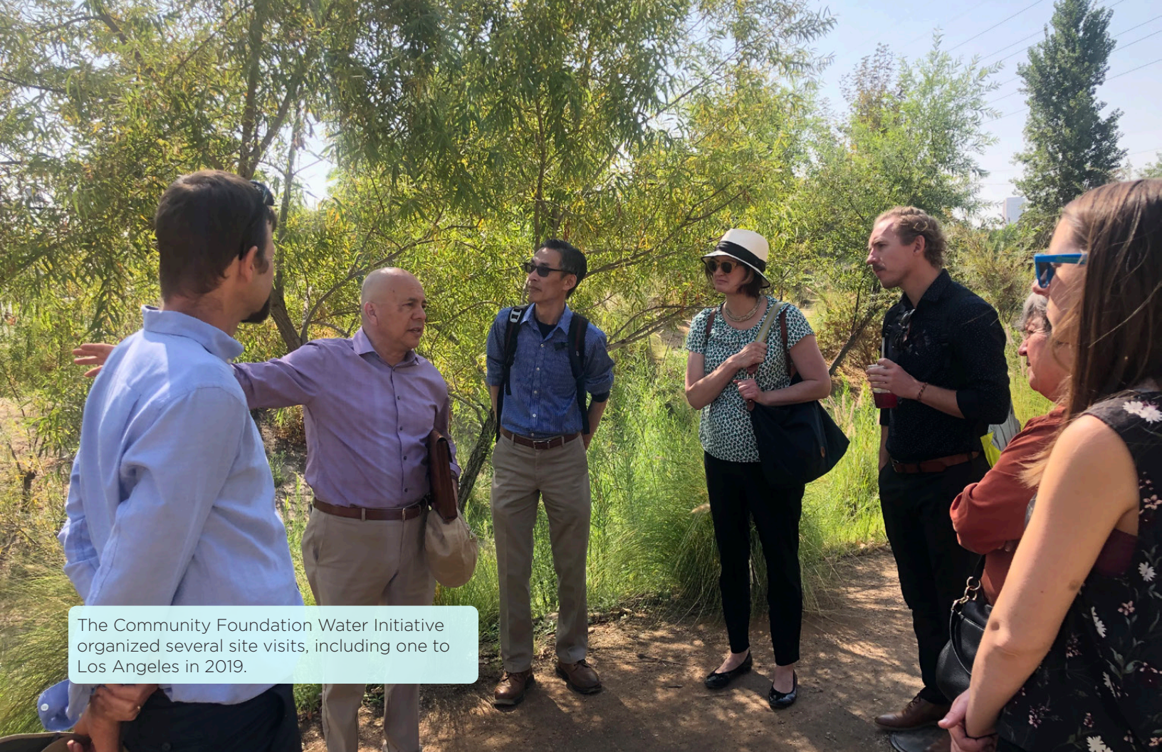
The Community Foundation Water Initiative organized several site visits, including one to Los Angeles in 2019.