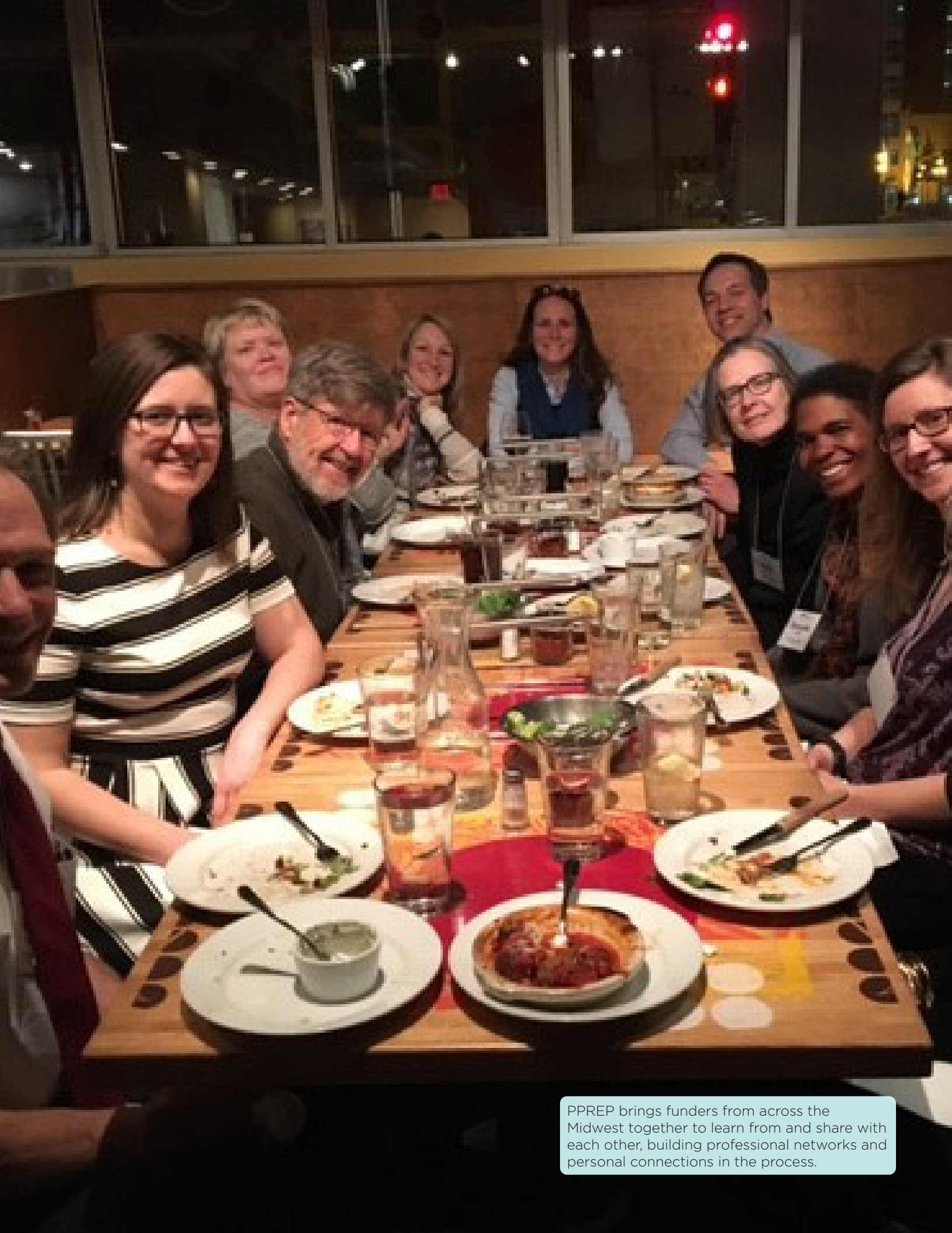
PPREP brings funders from across the Midwest together to learn from and share with each other, building professional networks and personal connections in the process.