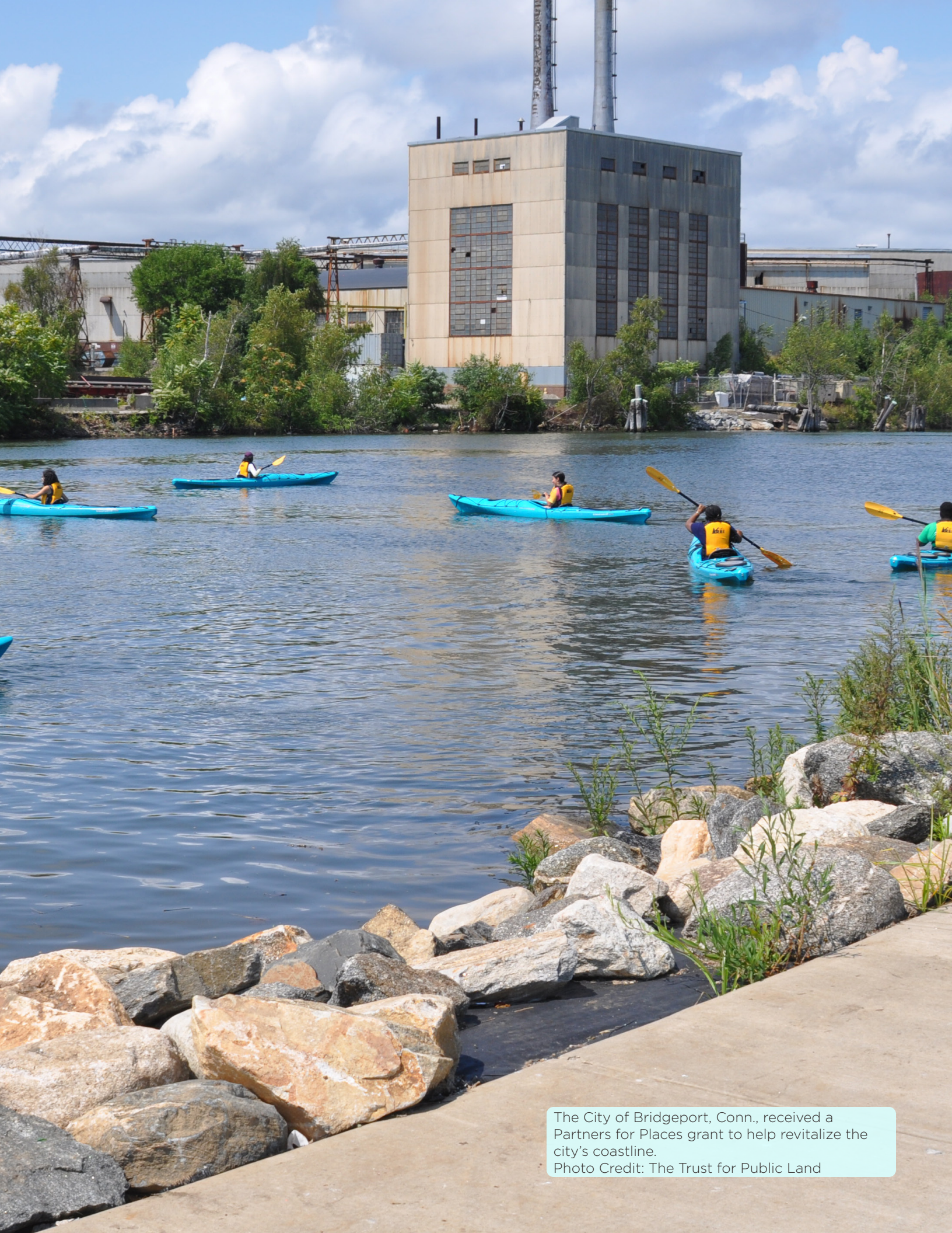
The City of Bridgeport, Conn., received a Partners for Places grant to help revitalize the city's coastline.